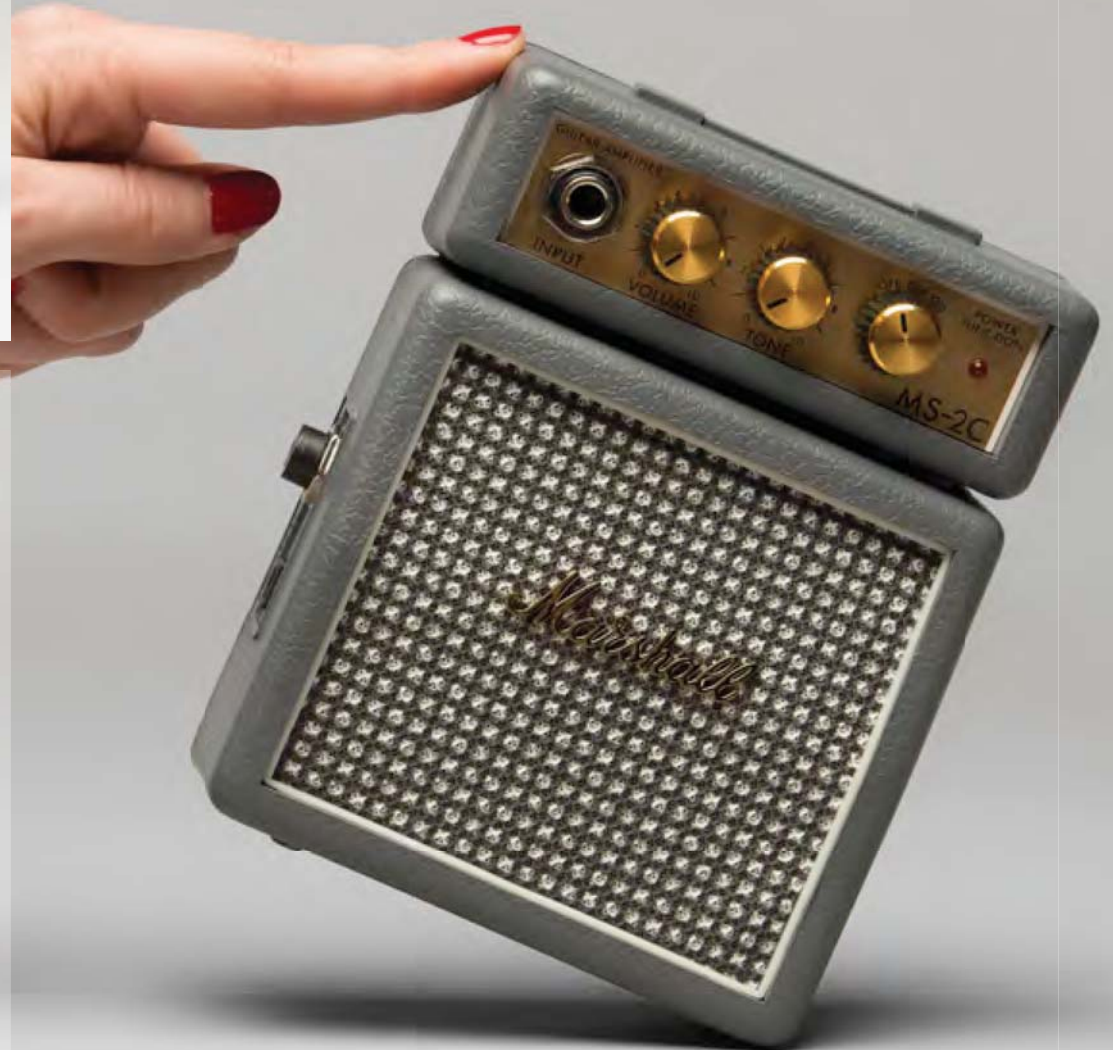
1 MS-2R - Red 2 MS-4 - Black full stack MS2 3 MS-2C - Classic 4 MS-2 - Black MS4

1 Watt of gut-wrenching power: featuring channel switching, a battery and a headphone jack that doubles as a preamp out, so you can rock while you roll. The MS-2 mini half stack is anything but a toy. It has bags of serious tone, and has even been used in professional recording studios; placed in a shoe box with a hole cut for a microphone. We kid you not.