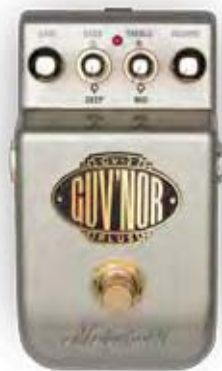
1 GV-2 Guv'nor Plus

An update of our '80s classic. The GV-2 delivers incredible levels of distortion. Go from vintage amp break-up and chunky classic rock tones, to modern-day super saturation with liquid sustain. A Deep control has been added to give the similar feel and response of the resonant thump of a Marshall 4 x 12" cab.