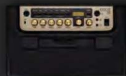
CODE25 25 Watt combo

Download the Marshall Gateway™ App for your iOS or Android device to control CODE's panel functions, easily deep edit Presets and stream audio via Bluetooth. Share and swap Presets with other CODE users and connect CODE via USB to record with your DAW. CODE is a powerful tool that lets you make music your way.