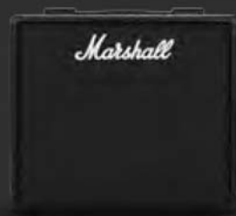
CODE50 50 Watt combo

From practice to performance, CODE50's got it covered. Intimate enough for quieter or 'silent' practice yet gutsy enough for live performance. With MST modelling, professional quality FX, Bluetooth/USB connectivity and custom voiced 12" speaker, CODE50 offers maximum flexibility.