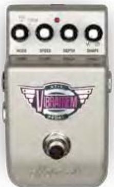
5 VT-1 Vibratrem

The ED-1 modifies dynamic response, boosting decaying signal and flattening signal peaks. This allows you to control attack and boost clean sustain - great for clear, clean chords, and muted, percussive funk lines. The ED-1 also features an Emphasis control, which allows you to target the frequencies you want to compress.