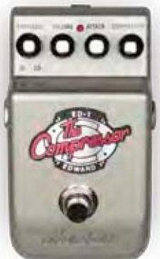
4 ED-1 Compressor

This one's for going to extremes. Get the aggression into your playing with eye-watering levels of distortion. But you're always in control, and because this is a Marshall pedal, it's never at the expense of tone - a must-have for serious metal players.