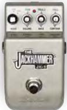
3 JH-1 Jackhammer

With two modes, it's like two pedals in one. Boost mode gives you more upfront without affecting your original tone. This gives solos more lift. Switch to blues mode and go warmer and more natural for leads with a distinctly '60s 'Bluesbreaker' flavour.