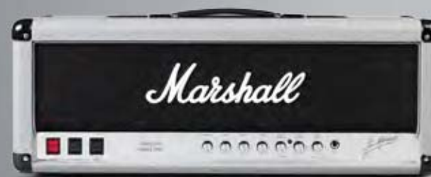
2555X 100 Watt head

Since the Jubilee series was discontinued in 1988, one of the most common questions we have been asked is, "when are you going to re-issue the 2555 Silver Jubilee head?" And so, by popular demand, we have created the 2555X.