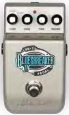
2 BB-2 Bluesbreaker II

An update of our '80s classic. The GV-2 delivers incredible levels of distortion. Go from vintage amp break-up and chunky classic rock tones, to modern-day super saturation with liquid sustain. A Deep control has been added to give the similar feel and response of the resonant thump of a Marshall 4 x 12" cab.